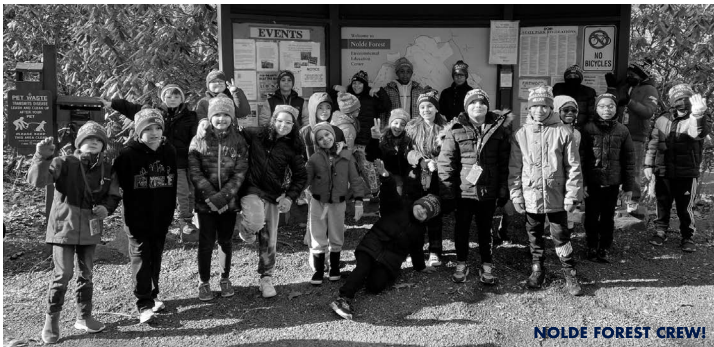
NOLDE FOREST CREW!