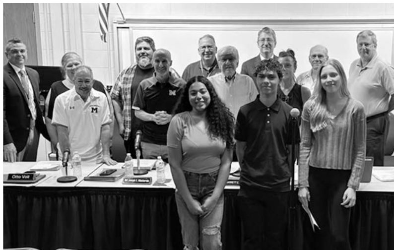
MJHS Student Council visited with MSD Board Members at their April meeting.