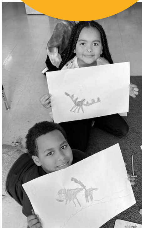
First graders learned more about dinosaurs and shared pictures of their favorites.

For the second year, the Muhlenberg School District ran MSD Springstyle 2023. This program invited our K-12 students to stay after school for additional education opportunities. More than 275 students registered for this fun and enriching learning experience. Thirty teachers from across the district worked with these students over the course of the eight-week program from February until April. All students were provided with a snack and spent time working on social-emotional skills through cooperative learning activities and engaging content. Students in grades K-2 worked on early reading skills. Students in grades 3-8 focused on test prep for the upcoming PSSA assessments. Students in grades 9-12 chose