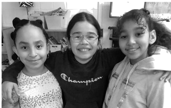
Second Grade Students work on beginning sounds with a board game.

to stay either for credit recovery or Keystone test prep. MSD teachers built relationships with their students while providing captivating lessons.