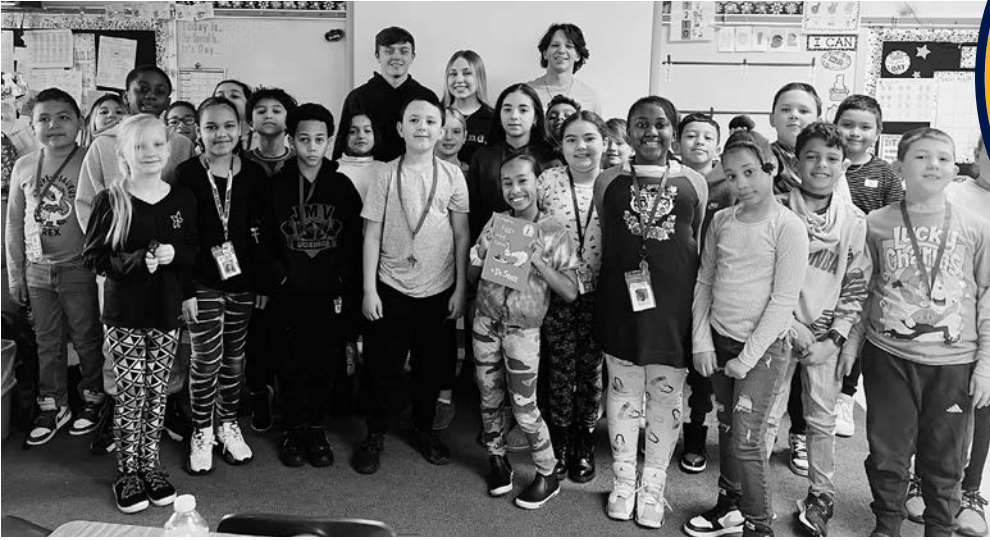
In March 2023 during Read Across America, our high school Aavidum students visited Muhlenberg Elementary Center.