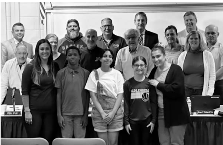
C.E. Cole Intermediate Student Council visited with MSD Board Members at their May meeting.