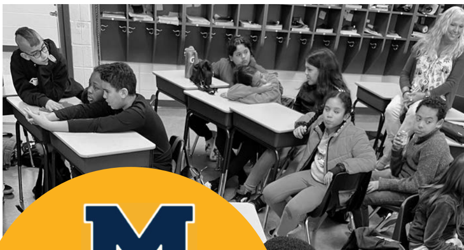
Fifth graders collaborate to solve a reading mystery.