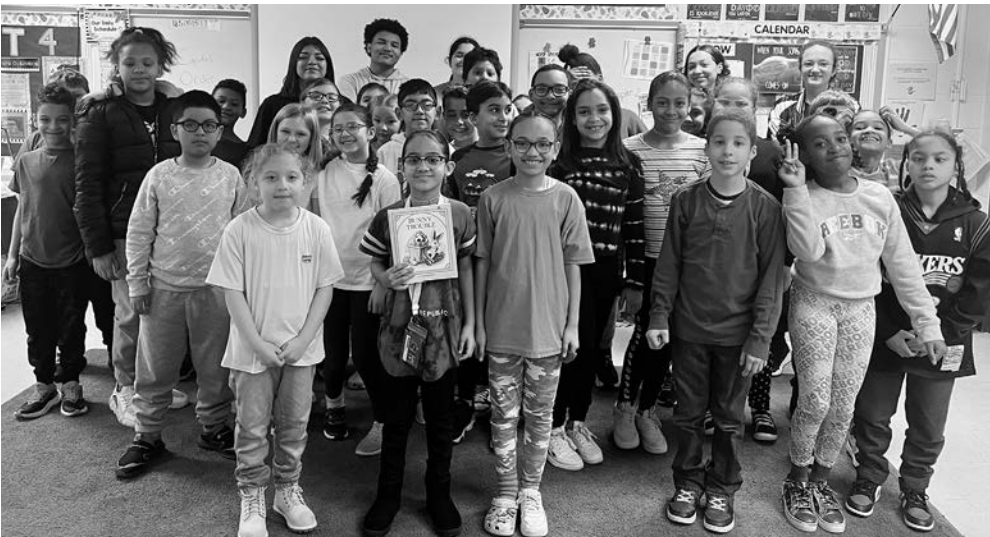
They had a great time getting to know and interacting with our second and third graders.