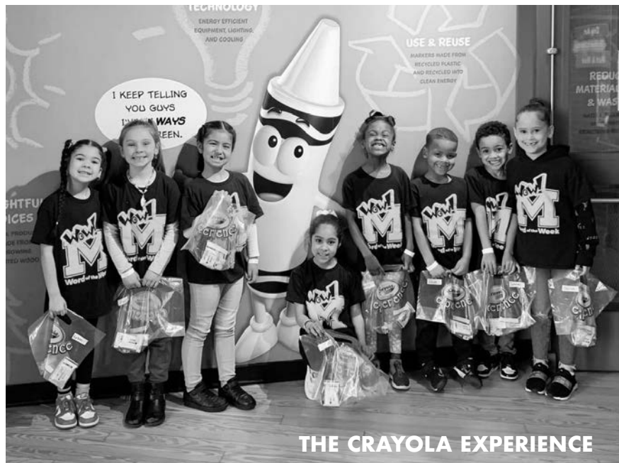
THE CRAYOLA EXPERIENCE

Earlier this school year, presenters from Nolde Forest visited MEC to teach our third-grade students about birds and adaptations. After the visits to MEC, students went to Nolde Forest to search for birds and enjoy a nature walk. As the school year winds down, third grade students are looking forward to the end of year picnic celebration at the Temple Playground. We are looking forward to making more