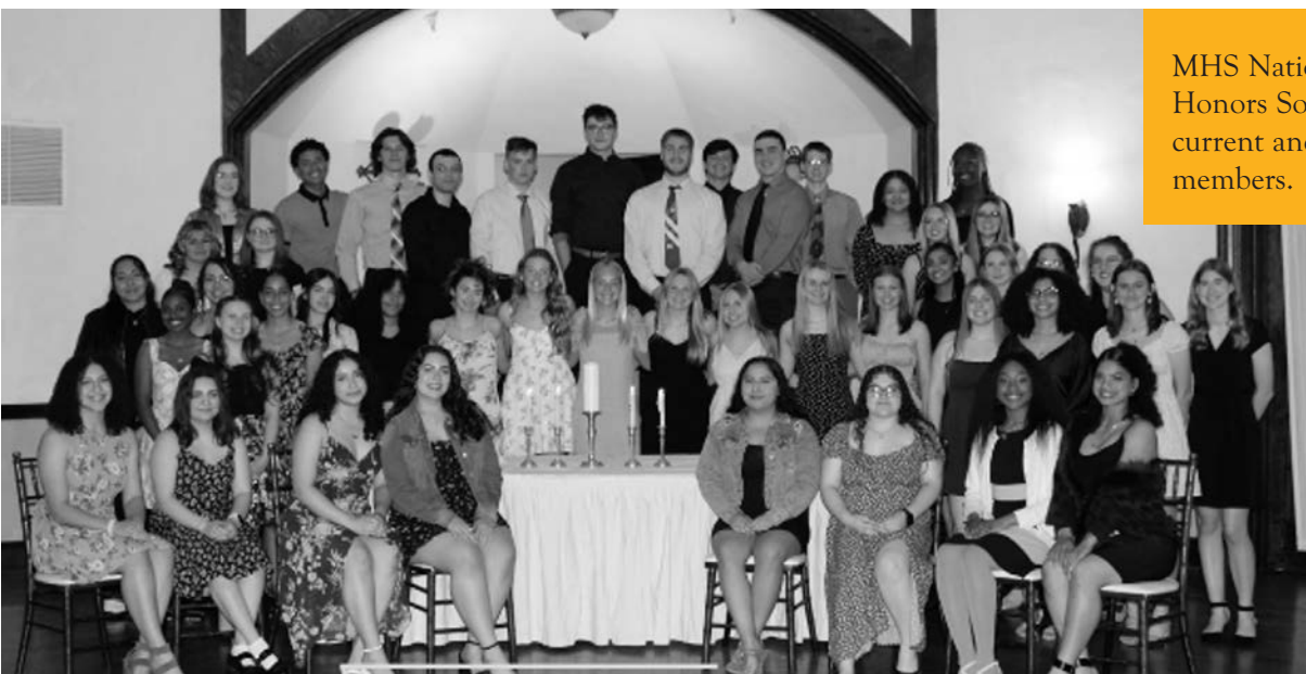
MHS National Honors Society current and new members.