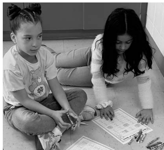
Second graders worked together to learn more about parts of speech.