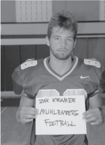
Zak Kramer Stevens Technical School Football

The following 2009 graduates also are playing a sport at their respective colleges. Best of luck to these student athletes!