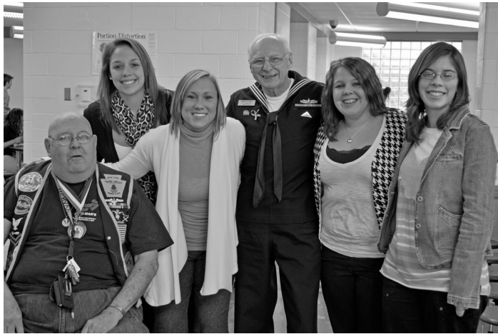
Veterans and students at Leo Club Veteran's Day breakfast

On November 1, the Muhlenberg High School Leo Club sponsored the Sixth Annual Veteran's Day Breakfast to honor those that have served and thank them for the great burden and responsibility of defending our country. The breakfast was with approximately 75 veterans attending.