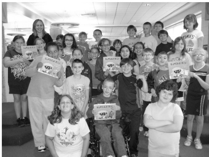
Muhlenberg Elementary Center students display the winner of the 10th annual Muhl Medal Contest.